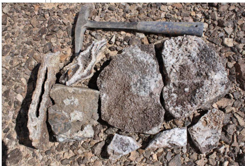
Crystal plates from the McCracken Mine