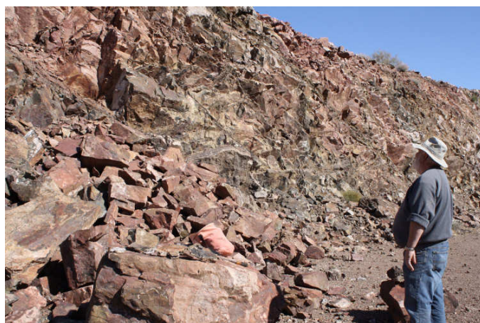
Dave Reimers at the base of the crystal plate wall