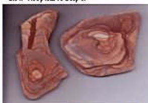
New WA picture Jasper

Mansford Grange 1265 Railroad Ave. Behind IGA Displays & Demonstrations