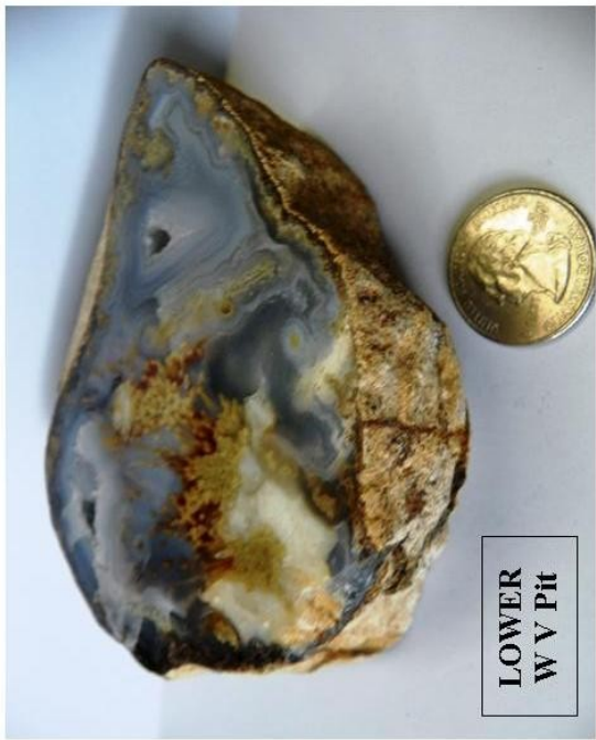
LOWER WV Pit