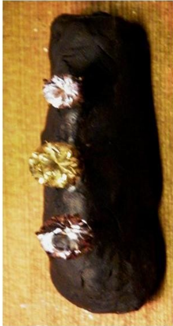
FACET WV Pit